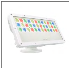
ColorBlast Intellihue Powercore