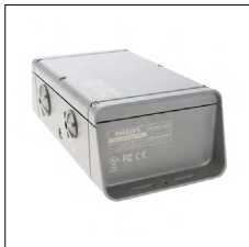
Data enabler pro