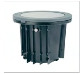
RGB Decoscene LED

The Loudoun Monument, also known as Queen Eleanor Cross, is a memorial located in Ashby-de-la-Zouch. Found in the centre of the Leicestershire market town, the monument pays tribute to Edith Rawdon Hastings, who was the 10th Countess of Loudoun. Commissioned by her widowed husband, Baron Donington, it was built by architect Sir George Gilbert Scott and unveiled in July 1879.