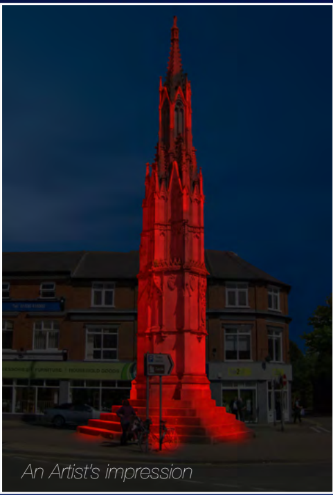
An Artist's impression