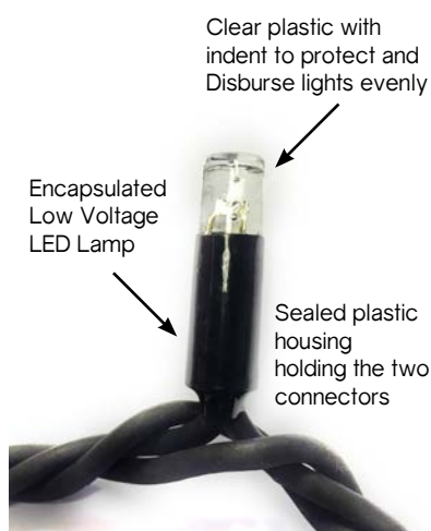
4 core 0.5mm rubber cable